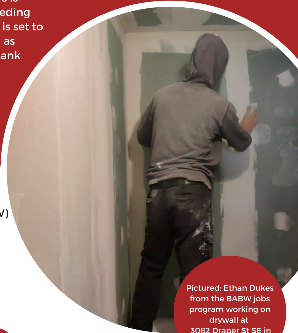
Pictured: Ethan Dukes from the BABW jobs program working on drywall at 3082 Draper St SE in Warren